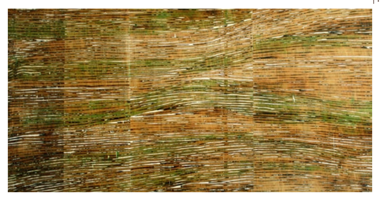
#21 Lower Norton Mixed media on Luanne 91 x 177.5 cm