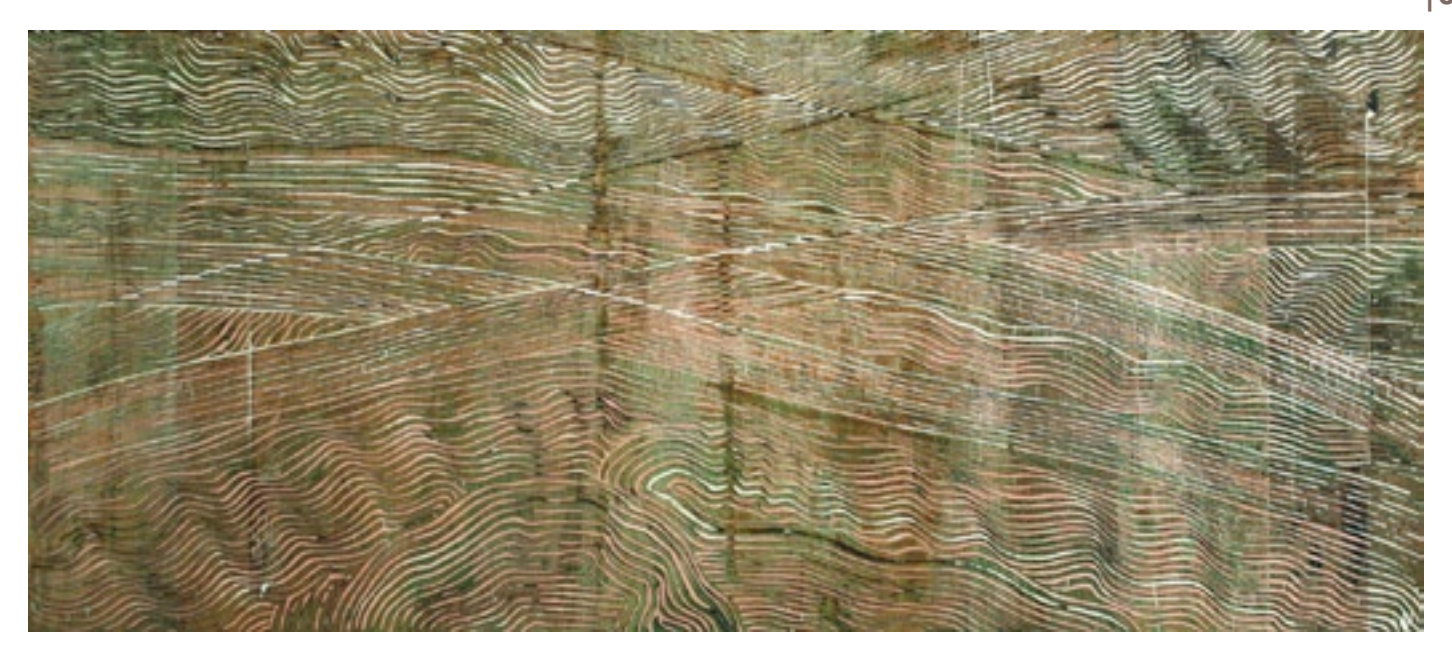
#13 Crossing Yulong Mixed media on Luanne 91 x 213 cm