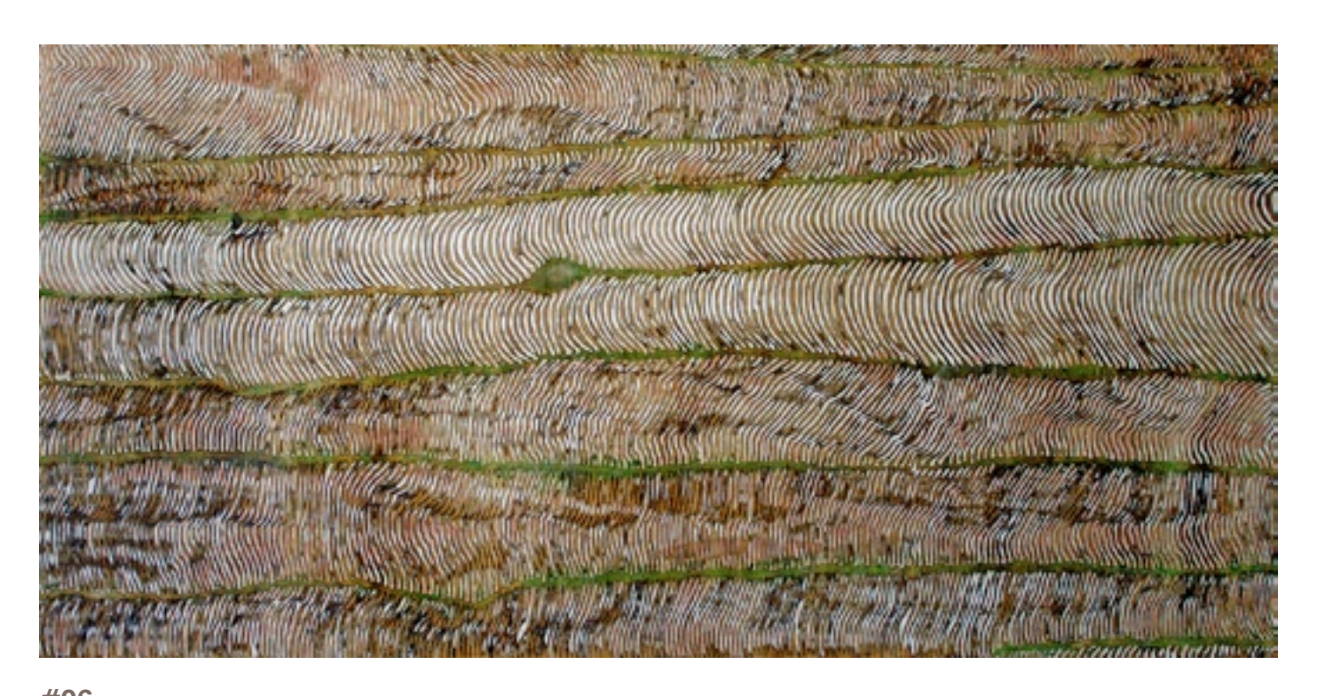
Barton Spring 4 Mixed media on Luanne 122 x 244 cm