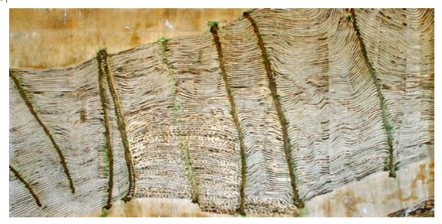
#11 Chetwynd Trunk Mixed media on Luanne 119 x 240.5 cm