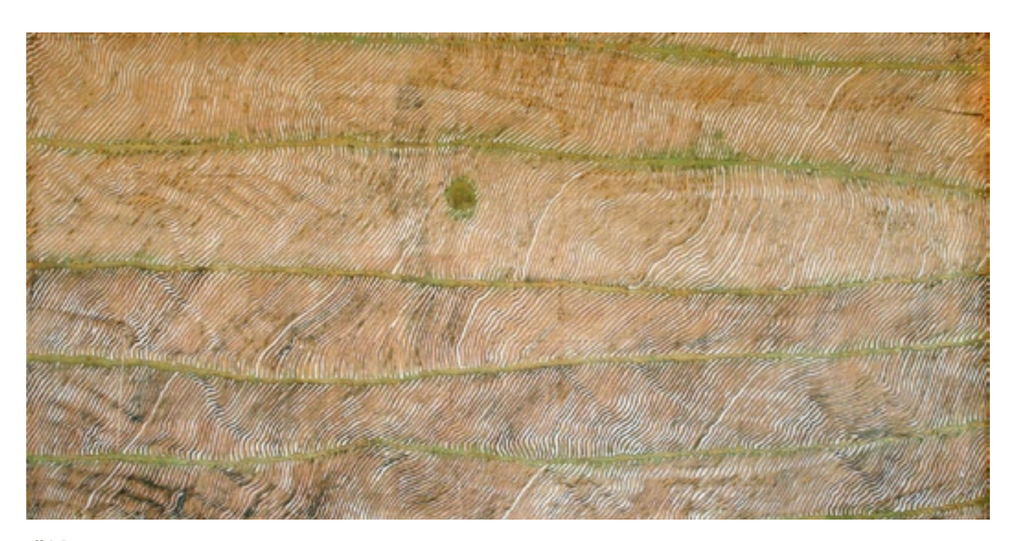
Barton Spring 5 Mixed media on Luanne 122 x 244 cm