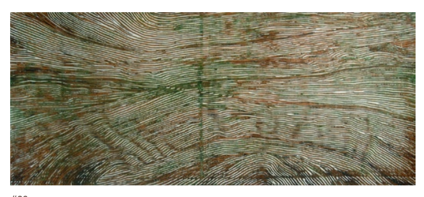
Yulong Mixed media on Luanne 91 x 213 cm