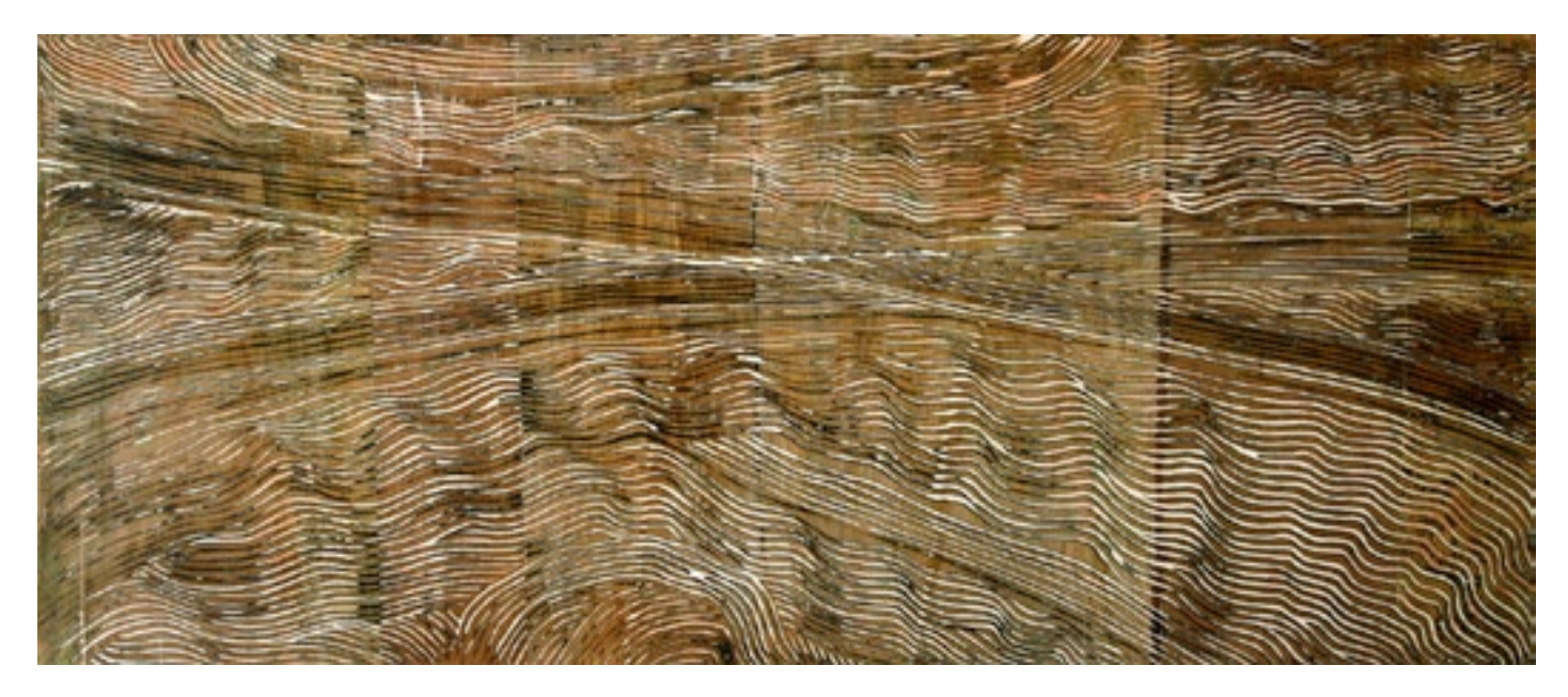
#24 Over Yulong Mixed media on Luanne 90 x 213 cm