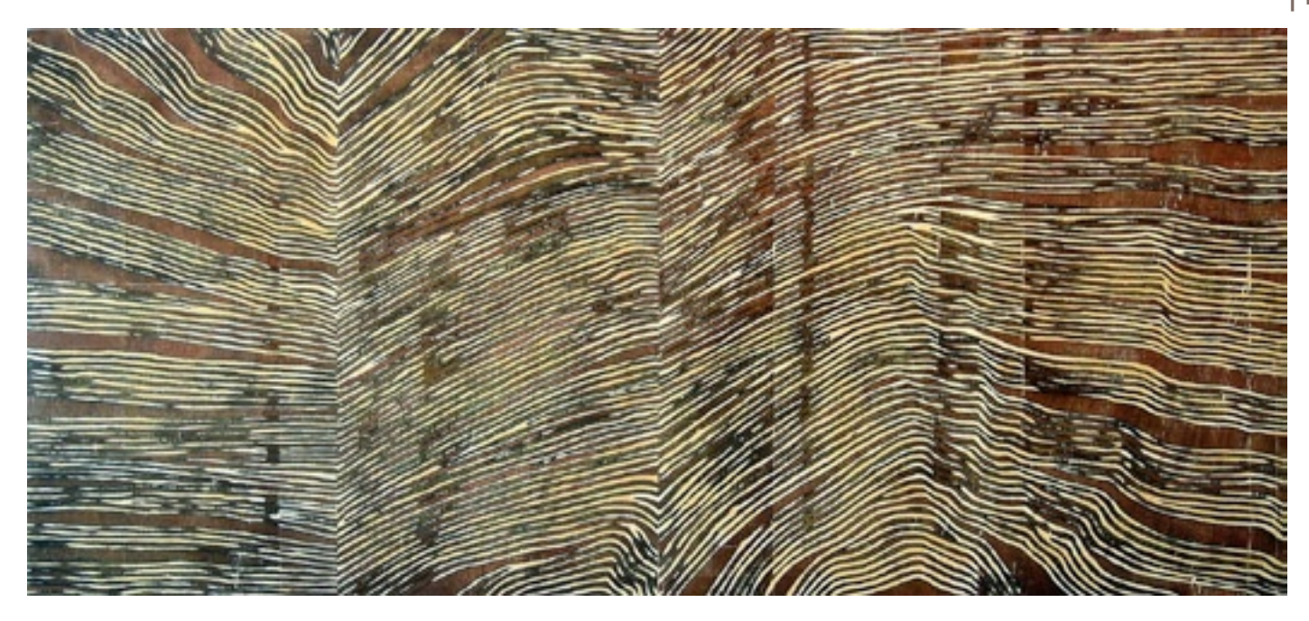
#17 Fulham Hill Mixed media on Luanne 91 x 200 cm