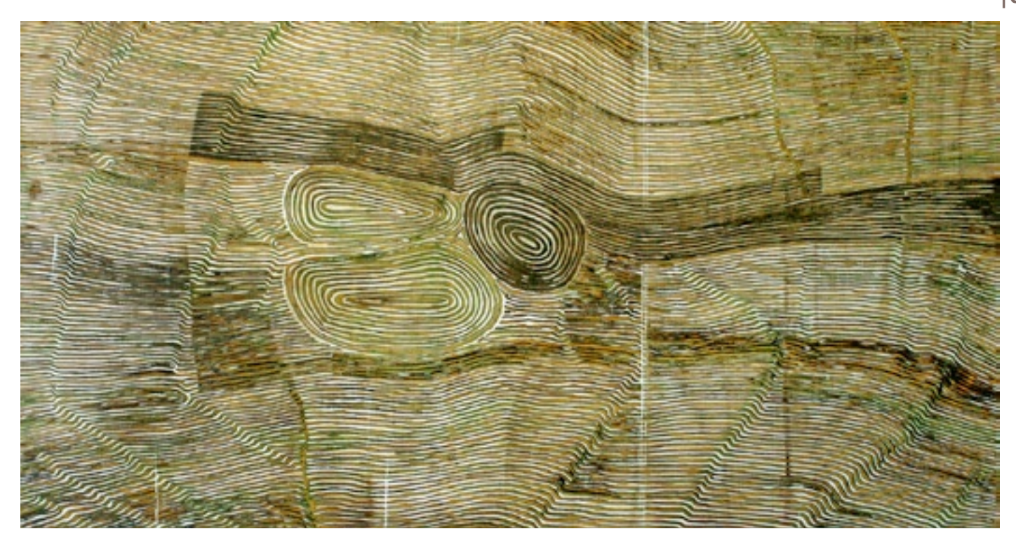
#09 Barton Swamps Mixed media on