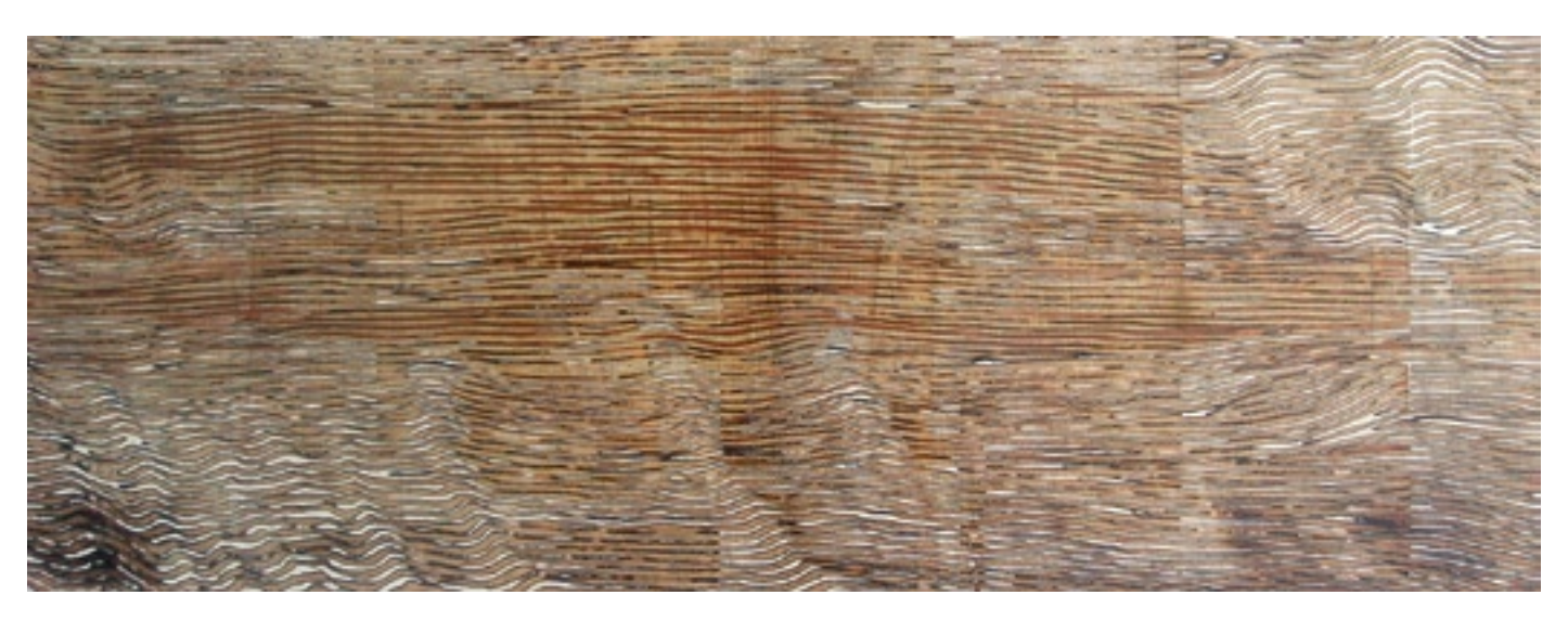
Mallee Country Mixed media on Luanne 73.5 x 213 cm