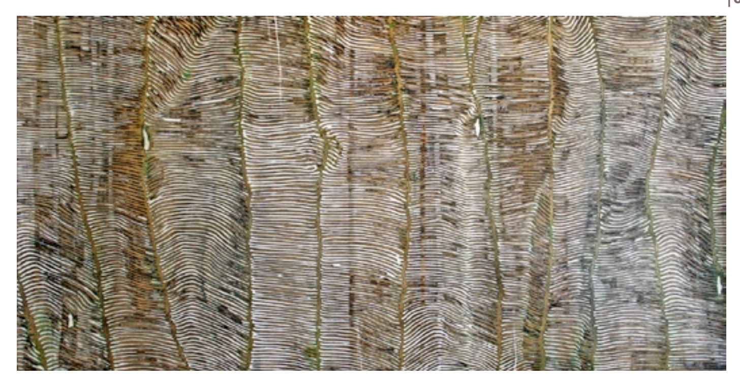
Barton Spring 3 Mixed media on Luanne 122 x 244 cm