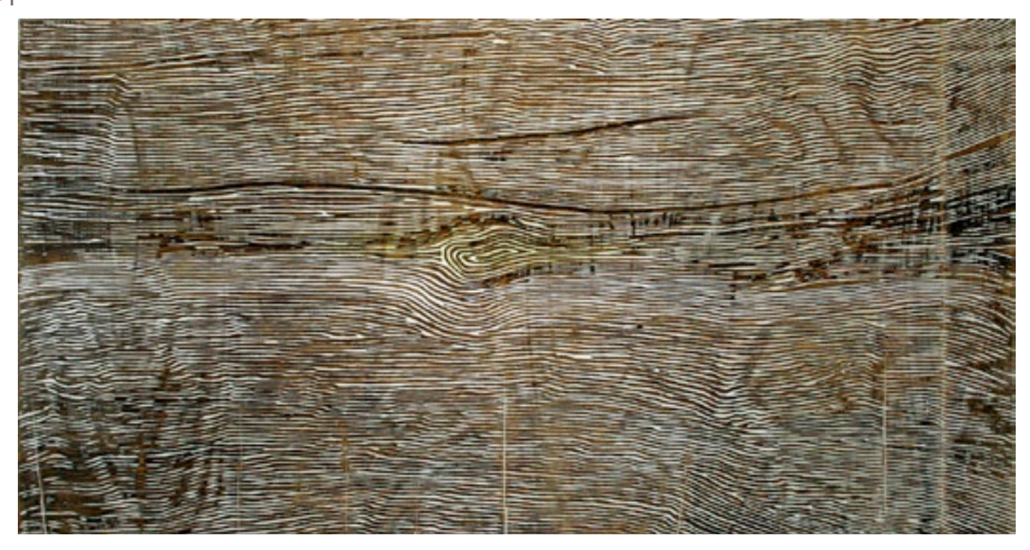
#07 Barton Spring Mixed media on Luanne 122 x 232 cm