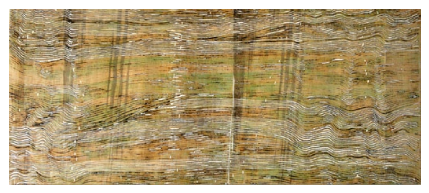
#12 Crossing Glenisla Mixed media on Luanne 91 x 213 cm