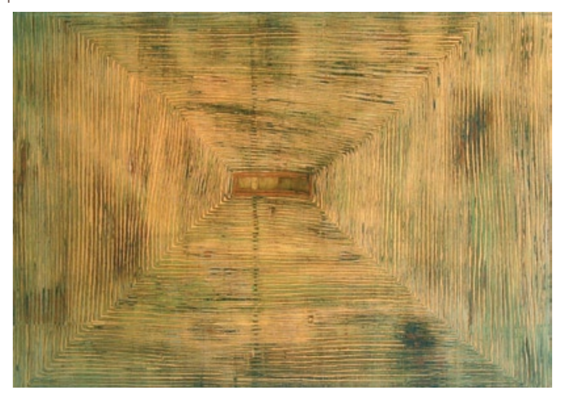
#19 Herd's Paddock Mixed media on Luanne 120 x 172 cm