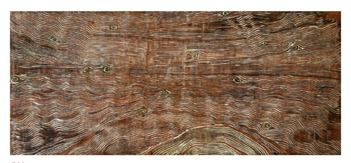
#14 Dalton's Hill Mixed media on Luanne 91 x 213 cm