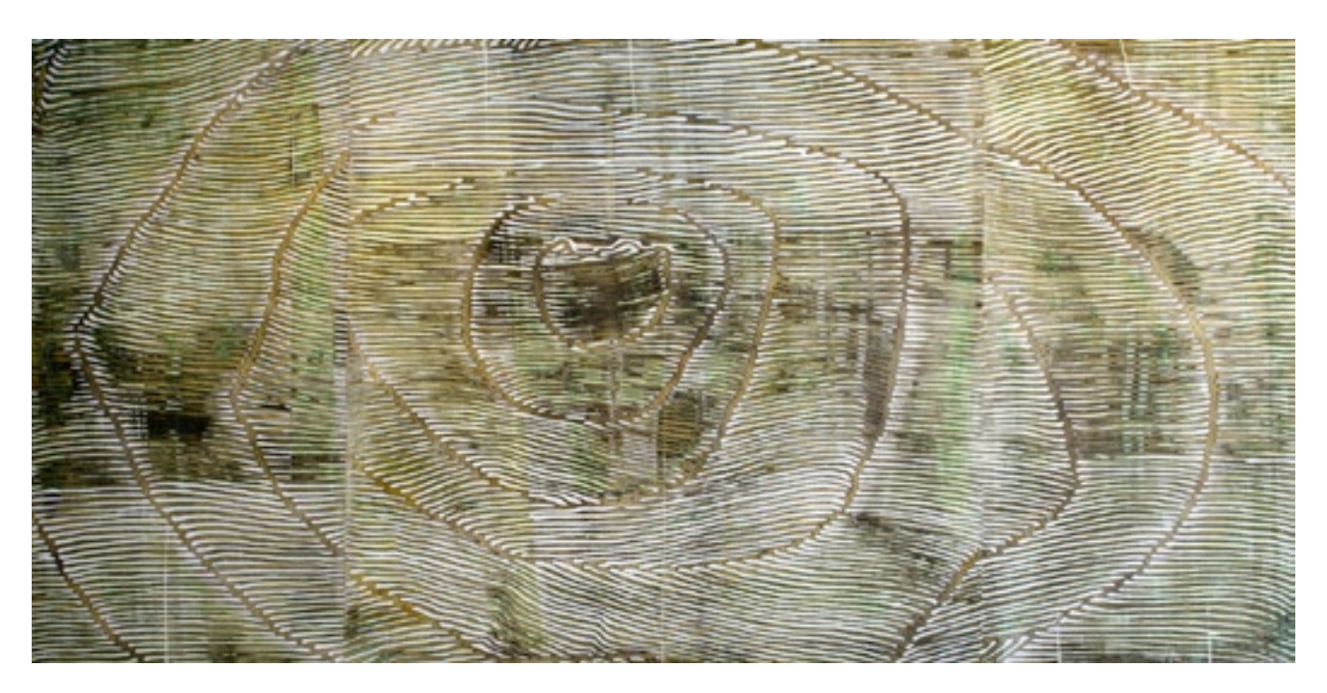
Wash Tomorrow Friday Mixed media on Luanne 122 x 244 cm